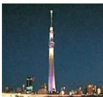
Sky Tree – Tokyo's Latest Landmark