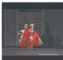
The Puppet Art of Bunraku