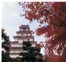
Autumn – Brilliant Fall Colours