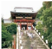
Kamakura – Home of Samurai Culture