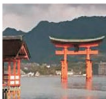
Miyajima - Island Shrine to Nature