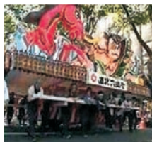
A Festival of Festivals – Tohoku Rokkon Sai