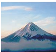
Mt. Fuji, Japan's Sacred Mountain