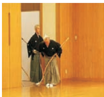
The Spirit of Budo