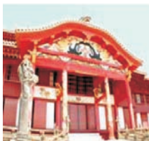
Okinawa World Heritage