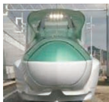
Shinkansen – High- speed Rail System