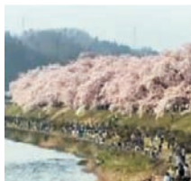
Spring – Blooming Cherry Blossoms

Continuous Screening on 21st and 22nd December from 11 am to 7 pm