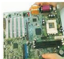
Technology Inspired by Tradition